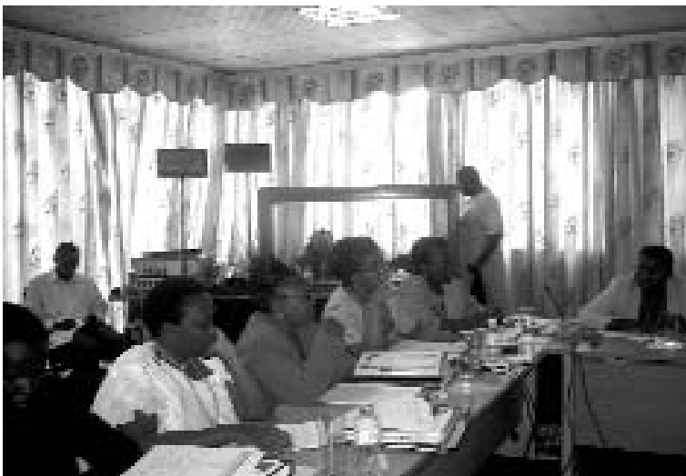
Participants in a plenary discussion

The last session was group work that focussed on a detailed discussion of the key issues arising from the report. The next section describes these discussions in detail.