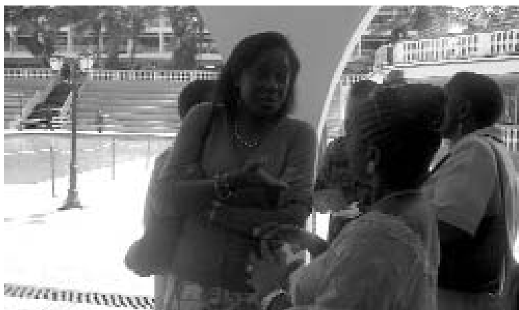
Participants discuss the way forward