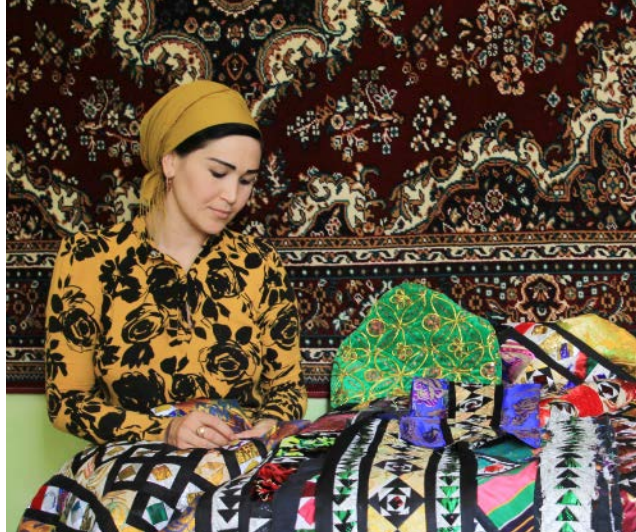
Woman making national Tajik dress, an example of an income generating activity.

The research found that the group most affected by various forms of gender-based violence was young women aged 18–24, who all reported having experienced violence in the 12 months prior to the research being conducted. Young married women are particularly vulnerable both to intimate partner violence (IPV) and violence from in-laws.