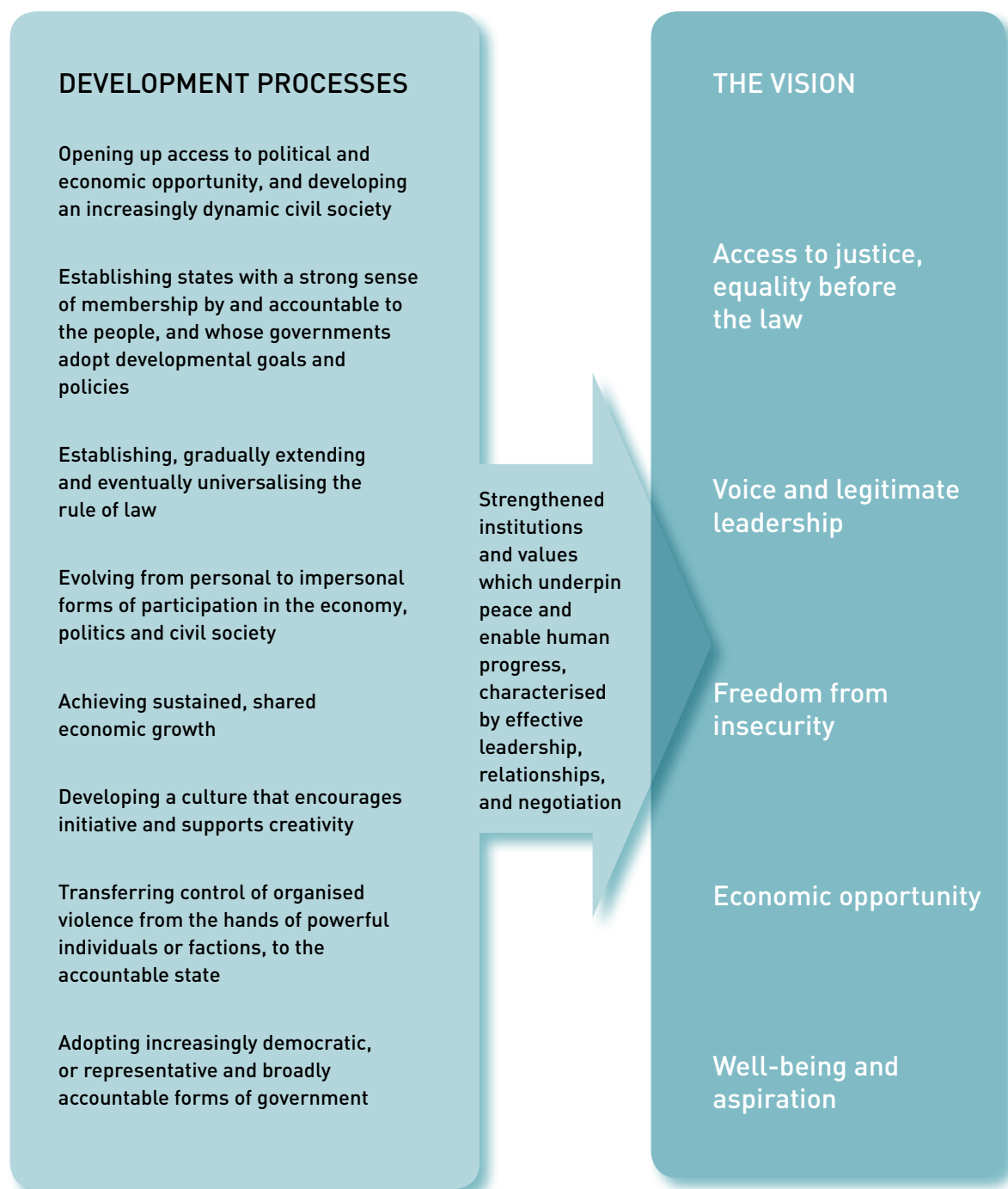
Figure 2: A model of human progress

The path of progress towards a vision in which people are able to resolve their differences without violence, while continuing to make equitable social and economic progress, and without lessening the opportunities for their neighbours or future generations to do the same. Key processes which contribute to and build on the institutions and values which enable development are shown on the left of this model; these lead eventually towards the vision of progress represented by the factors on the right of the diagram. While the vision provides a guide, it is elements such as those on the left that need to be led, catalysed or supported by those seeking to promote human progress.