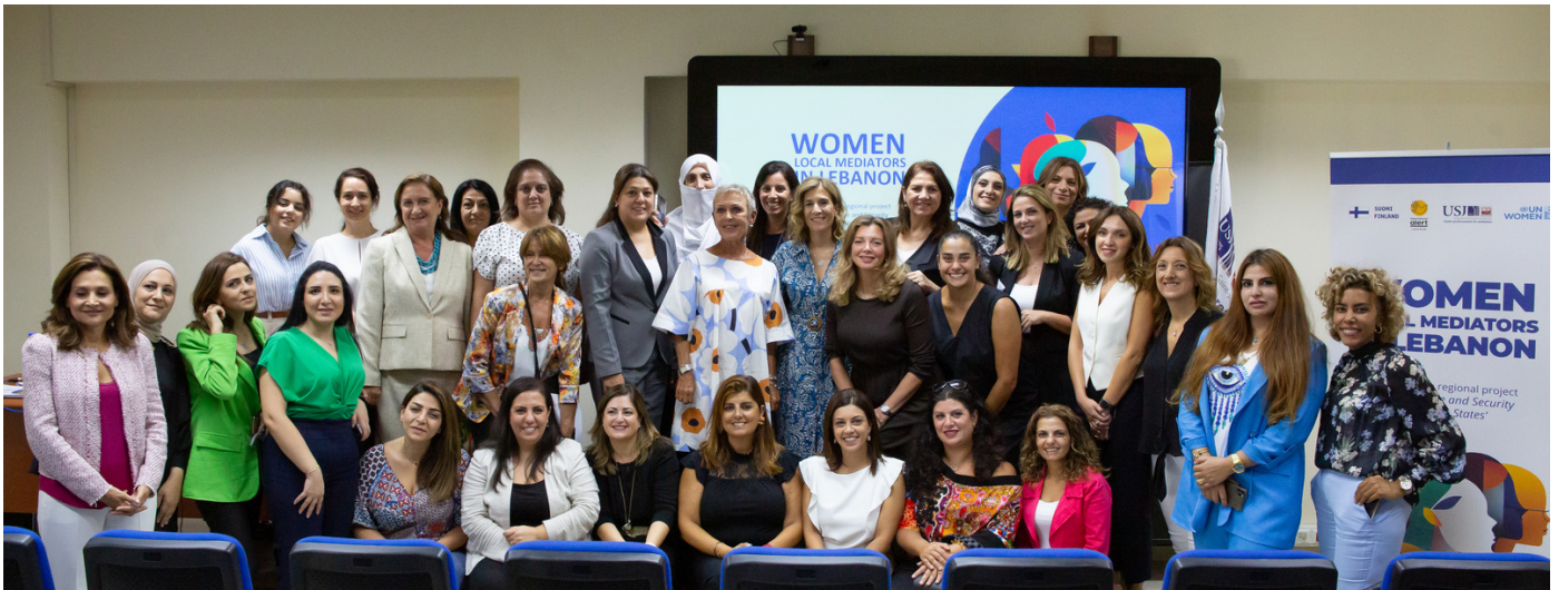
Our women mediators meeting with the Ambassador of Finland in Beirut, Anne Meskanen, and sharing their contributions to conflict prevention within their local communities.