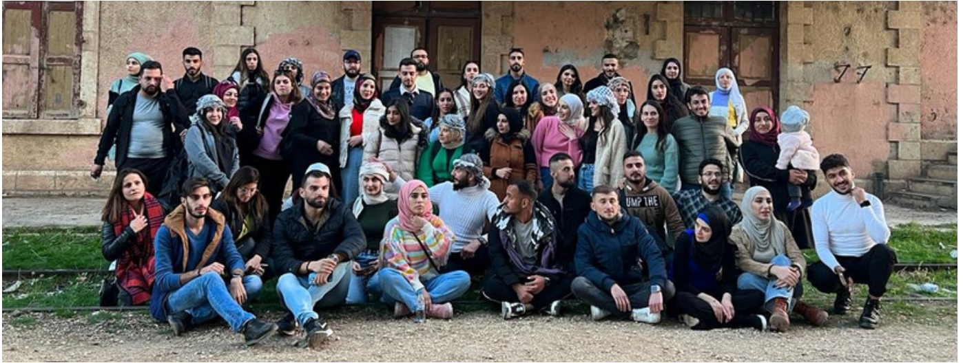
An exchange visit between Tripoli and Bekaa youth as part of the European Regional Development and Protection Programme (RDPP) project.