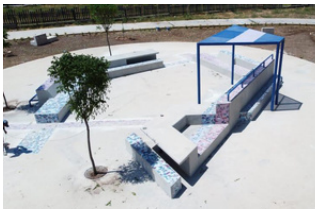
1 public space rehabilitated in Majdal Anjar