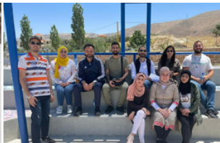
1 safe space created in Tripoli

to enhance social cohesion, inclusivity and ensure the participation of different community members.