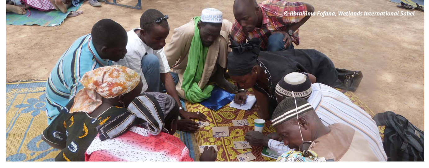
Villagers in the Mopti district of the Inner Niger Delta collaborate on a planning exercise