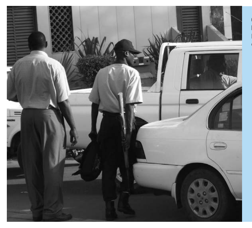
Off duty private security guard heads home carrying his weapon, Kampala, Uganda

The PoA specifically refers to the control of illicitly traded SALW. Armed crime and indiscriminate violence against civilians is perpetrated with both legally and illegally traded SALW. Inter-personal violence involving SALW, often meaning violence among domestic partners, is another place where legal and illegal weapons are used. There are often times when security forces, whether they be military, police or private, carry the SALW they have been issued for their profession whilst off duty. Research has demonstrated that these weapons are frequently used in domestic violence incidents where the wife or partner of the security officer is killed or injured. Therefore, in addressing inter-personal violence with SALW there is a need to reform or better implement national laws and controls. In post-settlement situations, where armed and often traumatised former combatants return from conflict, relationships in the home and community are often distorted. Sons who were combatants no longer show respect for their parents and gender relations are antagonistic, with women frequently targeted as a vent for male frustrations and violence.