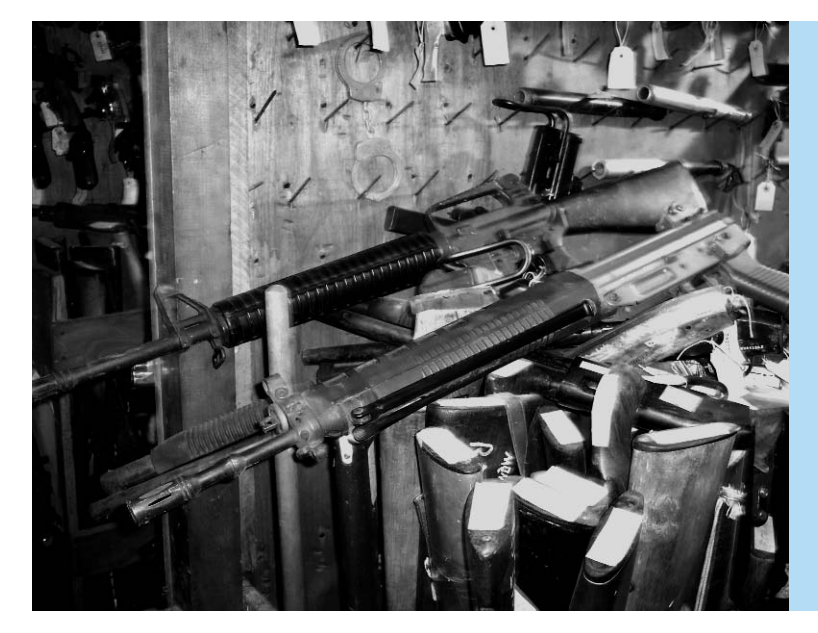
Weapons collected by the Police Force in Rio de Janeiro, Brazil

Advocating for textual changes to the PoA to be considered at the 2006 Review Conference that will both increase awareness regarding gender issues among Member States, the UN system and civil society and provide a stronger mandate for gender analysis, sensitivity and inclusion.