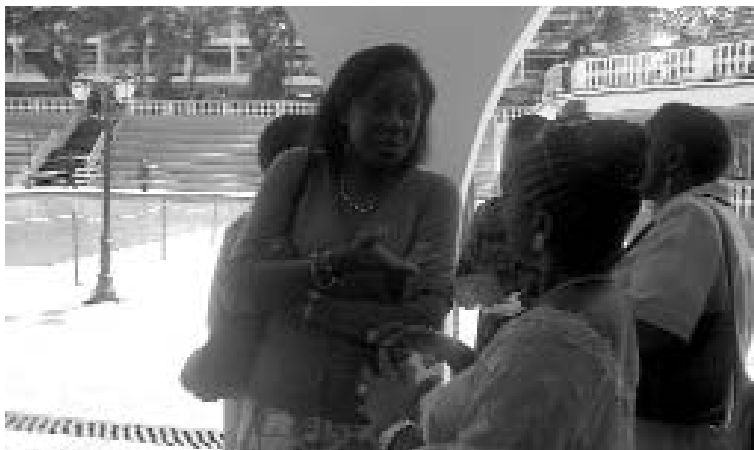
Participants discuss the way forward