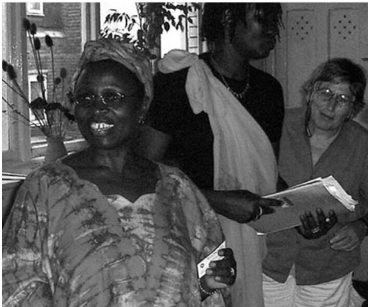
African participants discuss issues with academics and workshop facilitators.

Section one of this report describes how women understand their role in conflict transformation and peacebuilding, and the reasons why they are concerned with methods of monitoring and assessing the impact of this work. Section two considers how monitoring and evaluation has evolved in the field of conflict resolution, firstly as conflict assessment and later as peace and conflict impact assessment (PCIA) and conflict-sensitive approaches to development. Section three considers the relevance of these frameworks for the women engaged in peacebuilding activities that participated in the workshop on Assessing Impact , and highlights some important issues about the nature of women's peacebuilding activities and how it can be communicated to a wider audience.