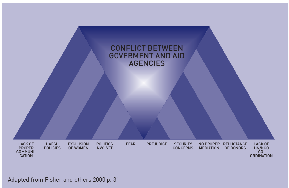
Figure 2: The Pillars Exercise

The pillars are a graphic representation of the capacities for war and capacities for peace set out in 'Do No Harm' (Anderson 1999). It illustrates graphically how the factors that perpetuate violence can often be counteracted by a positive capacity. The pillars exercise helps identify the many different factors that sustain conflict, some of the issues it reveals will probably be beyond the capacity of the organisation carrying out the exercise to address. In this sense, it does not necessarily help to identify strategies for the organisation. However, its value for participants is that it enables planners to break down a conflict into its constituent parts, and to see how different problems are interconnected.