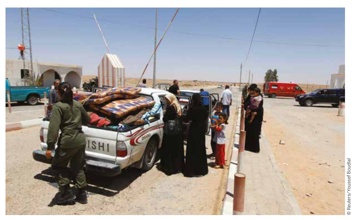
Custom officers check Libyan refugees from the western mountains at the Libya-Tunisia border crossing in Dhehiba. 2011.

the regional reality from the perspective of people who have been subjected to it – that is to say as a legitimising attribute of the postcolonial state and a mechanism for the exclusion and subordination of exocentric populations.