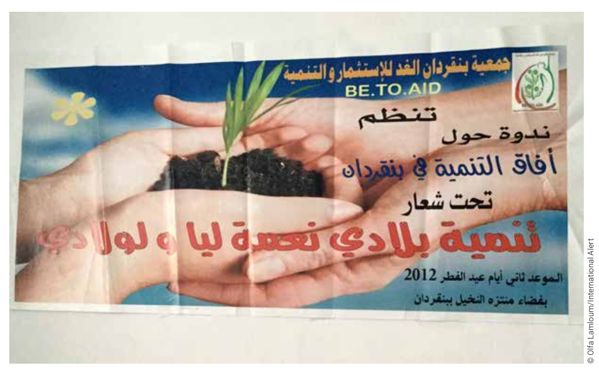
The poster of a local NGO reads: "Ben Guerdane tomorrow for investment and development."

principally centred on security, the welfare being reduced to minimal support aimed at protecting the state from the threat of the Libyan neighbour and settling the local population. For years, the city has been almost without any public and private investment. The army and local government have been the only employment opportunities for residents and the ultimate horizon of any social advancement offered by the state. This favoured the creation of client dependency links with the authorities, guaranteeing collective subjugation of a section of the population. Local inhabitants seem condemned to a sort of 'ethics of subsistence', marked by the survival imperative. Familial—and artisanal—style fuel smuggling, which emerged in the late 1990s and is practised by the impoverished population, has not changed the situation. Despite its remoteness and difficult access, the Dhehiba border has not escaped the greed of the circles of power. Excluded from Ras Jedir, the private preserve of the Trabelsi, members of the Ben Ali family seem to have been involved in smuggling copper, which transits the Dhehiba border post.