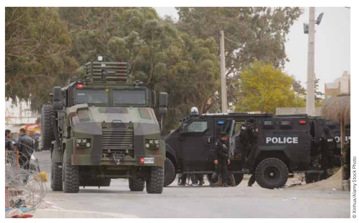
The security forces block a street in Ben Guerdane days after the March attack on the border city, 2016.

This protest space has gradually focused on two demands: opening the border crossing and development. Since 2014, general strikes, roadblocks on roads leading to the border crossing, sit-ins and public protests have emerged as repertoires of collective action, particularly mobilising youth in precarious employment and the unemployed. Some people see these protests as manipulations orchestrated by barons seeking to improve their position in the border economy, or the manoeuvres of a vengeful plot of the old regime. In reality, this protest, in essence, is similar to what has also been observed in other marginalised territories such as at Kasserine. It is the direct result of the politicisation and radicalisation of a part of the youth convinced, under the influence of the revolution, that employment and development are rights. It is also rooted in a long history of mobilising a register of regional marginalisation and demanding a national affiliation through economic and social inclusion.<sup>100</sup>