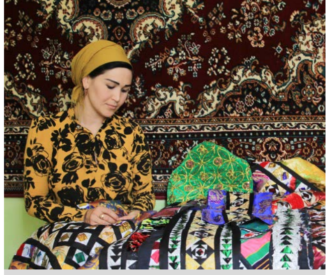
Woman making national Tajik dress, an example of an income generating activity.

This brief summarises the key elements and findings of the intervention and accompanying research, ultimately demonstrating that prevention of VAWG is possible in Tajikistan. This intervention can be tailored to suit other similar contexts.