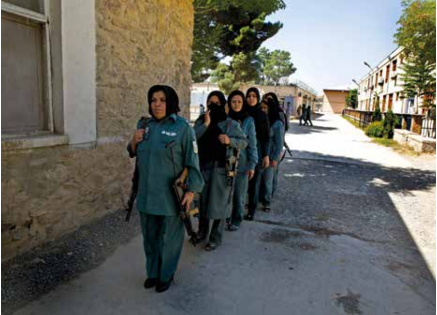
In Kabul, Afghanistan, training for women police recruits takes six months; they learn weapons, general policing and the rule of law, gender and human rights awareness.

Alongside tensions among women's organizations, progress on women's rights and empowerment is curbed by the way in which these issues are all too often expected to be addressed by women's organizations alone. The DRC case study notes that by funding women's organizations alone to address women's empowerment, donors restrict approaches that tackle the wider gender dynamics that underlie gender inequalities. 41 This unintentionally reinforces the way that women's organizations are already marginalized within broader civil society networks, alliances and consortia, where they are sometimes not 'in a position to influence other member organizations or the agenda of the network as a whole' and are therefore unable to secure the backing of wider civil society; 'the work they do is seen as separate', rather than an integral part of mainstream efforts to empower vulnerable communities and groups. 42