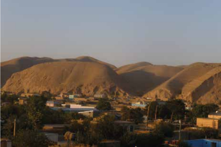
Maymana city, Faryab, Afghanistan. Faryab is one of the most insecure provinces in the north of Afghanistan, with frequent Taliban attacks across the province. Oxfam supported a peacebuilding project with partners from 2009 to 2014, building capacity of local peace Shuras.

Any assumption that civil society is inherently good for peace and democracy is challenged in contexts where dominant CSOs threaten both. 8 For example, the Taliban in Afghanistan began as a civil society movement that developed into a ‘politically repressive, undemocratic and violent regime’. 9 However, in a variety of conflict settings,