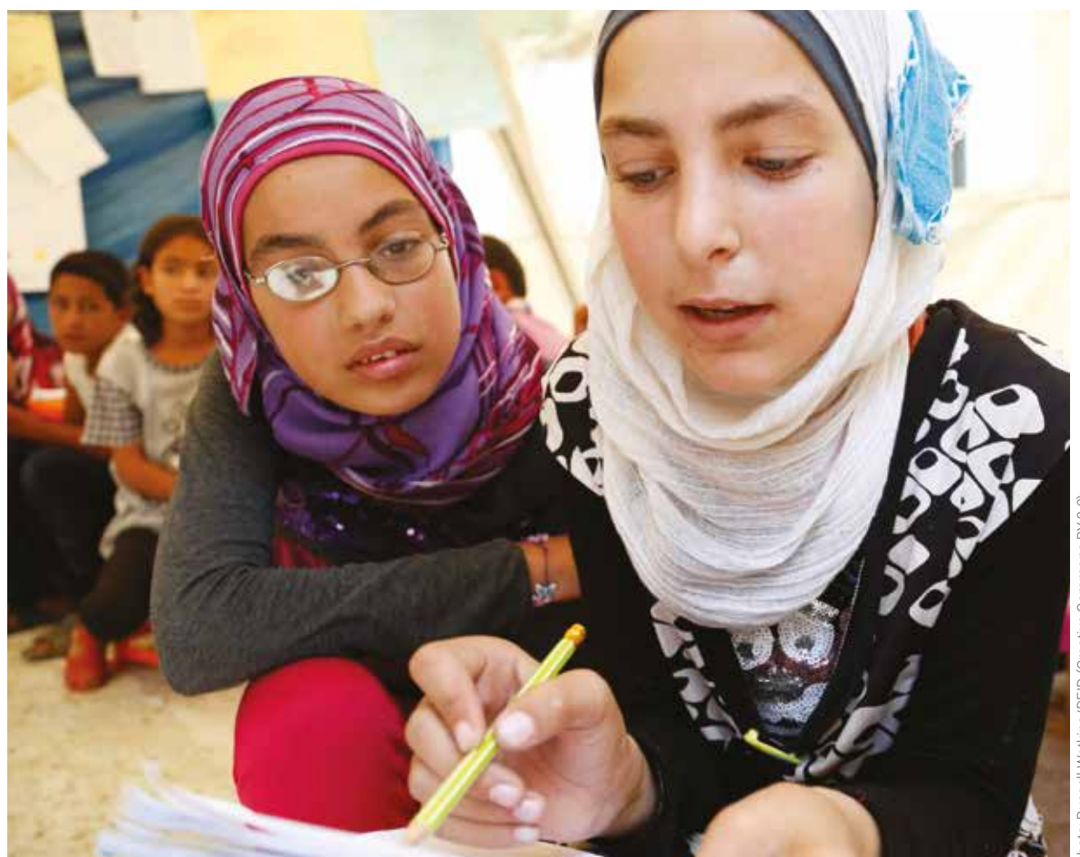
Syrian girls study maths at a temporary school set up by UNICEF and Beyond Association in northern Lebanon, 2014.

community models with buy-in from the municipalities would be ideal. The involvement of fathers in their children's education is currently at low levels, and in the spirit of gender equality it should be further encouraged. Moreover, parents often create an obstacle to initiatives seeking to bring children together and improve their perceptions and levels of trust, and need to be involved more strongly and creatively in these programmes.