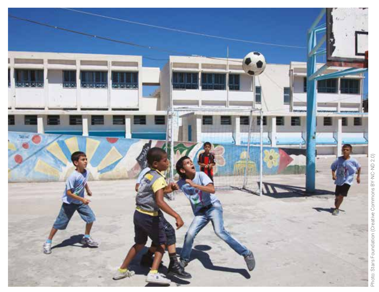
Boys take part in a play and learn session run by an NGO at a UNRWA school in Bsharri in northern Lebanon, 2012.