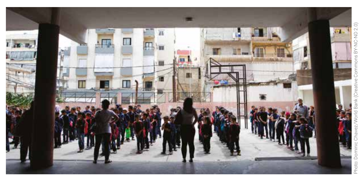
Lebanese and Syrian pupils line up for classes at a Lebanese public school in Beirut, 2014.

internationally recognised Lebanese Baccalaureate and the chance to use it anywhere in the world, as opposed to different types of baccalaureates certified by the Syrian opposition but not by Lebanon or other countries. Given the current international support to providing education for Syrian refugees in Lebanon through the national education system, it is vital to strengthen national capacities and ensure good-quality standards at a country level in Lebanon for all children alike.