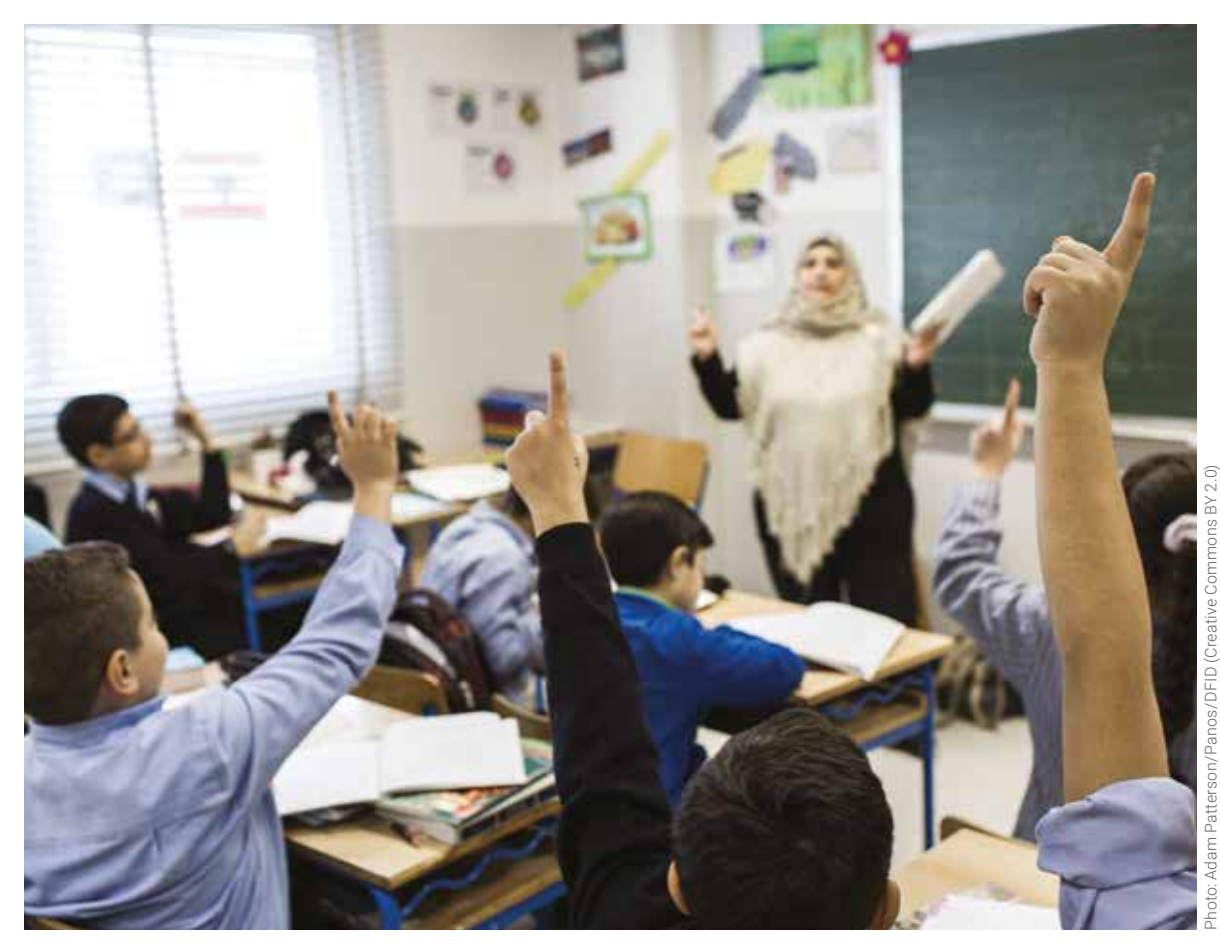
A mixed class of Lebanese and Syrian students in Beirut, 2016.

learning needs being more acute than those of their counterparts in the morning shift.<sup>30</sup> This lack of space to develop social skills is not beneficial to the children for developing positive perceptions and relations with others.