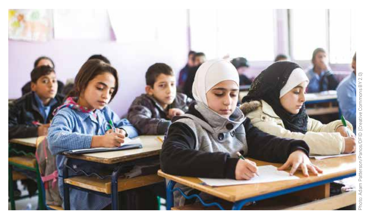
A mixed class of Lebanese and Syrian students in Bekaa, 2016.

education.<sup>16</sup> However, this research argues that inter-sector linkages stretch from formal education, through to non-formal education supporting the formal system, and to activities seeking to improve perceptions and relationships.