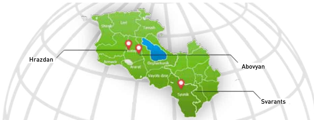
Figure 3: Iron ore deposits