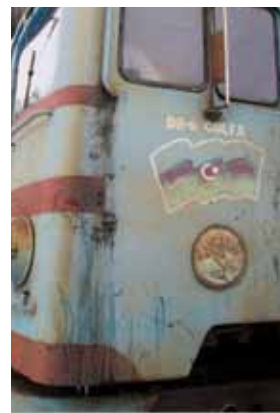
Photograph 3: Julfa depot