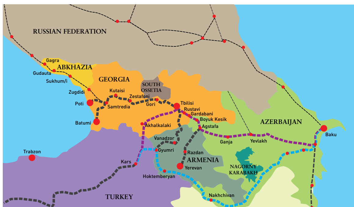
Figure 1: KGNMB and Kars–Akhalkalaki–Baku routes

This map is a modified version of the original taken from the Georgian Railways website ( www.railway.ge ). Geographical names and borders are a contentious issue in the South Caucasus context and so this map is only provided for reference and does not reflect any political or other views of the conflicts.