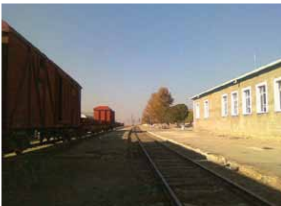
Photograph 2: Ordubad station