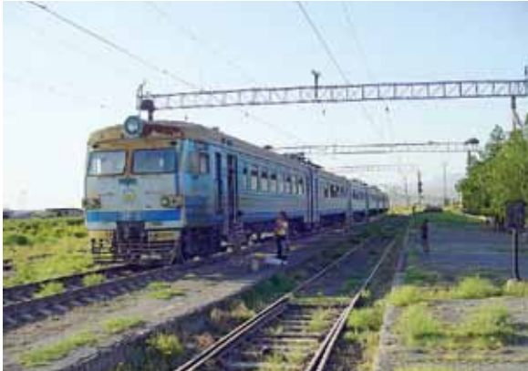
Photograph 1: Yerevan–Yeraskh suburban electric line at the terminus in Yeraskh on the Armenian-Azerbaijani border between the province of Ararat and the Nakhchivan Autonomous Republic