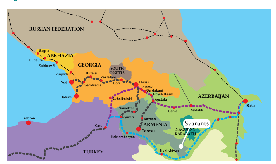
Figure 4: Svarants

If the rail link through Turkey (Kars–Gyumri) were to be opened, this line could carry the iron ore exports from Armenia. On the other hand, opening the rail link with Iran through Nakhchivan would mean a substantial reduction in the cost of transit to the port of Bandar Abbas. In the first case (Kars–Gyumri), Hrazdan and Abovyan would benefit most, while the route through Nakhchivan could carry iron concentrate from Svarants (Syunik), which has vast reserves. In addition, copper and molybdenum mines (Kajaran and Agarak) in the province of Syunik would also benefit.