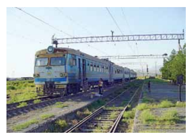
Photograph 1: Yerevan-Yeraskh suburban electric line at the terminus in Yeraskh on the Armenian-Azerbaijani border between the province of Ararat and the Nakhchivan Autonomous Republic