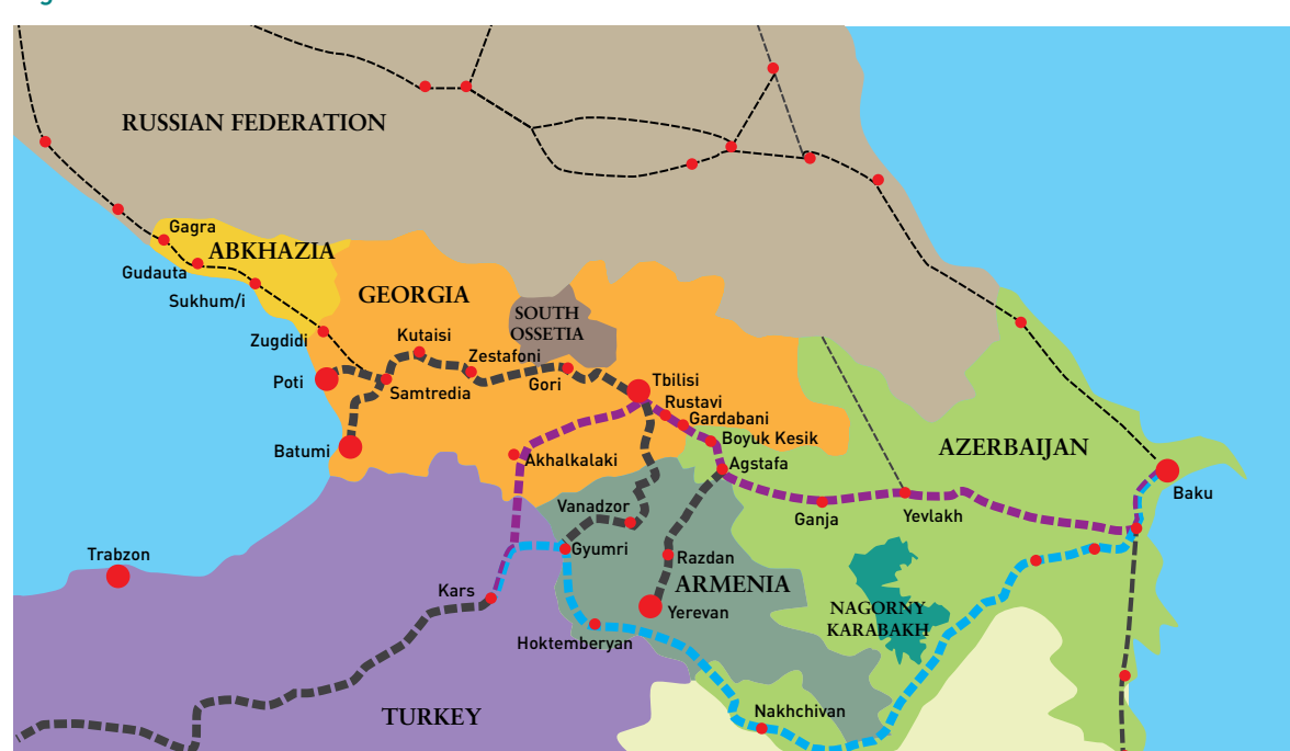
Figure 1: KGNMB and Kars-Akhalkalaki-Baku routes

The KGNMB route is shown in Figure 1. The Kars-Doğukapı (Turkey) and Akhuryan-Gyumri (Armenia) sections have not been operational for over 19 years and the rail border crossing to Turkey (Akhuryan-Doğukapı), equipped with a bogie-exchange facility, has not been functional since the early 1990s. The Akhuryan-Gyumri section (13km) has barely operated for the last 20 years (closed 14 September 1993) and is not electrified, which is also the case for the route through Turkey from Erzurum.